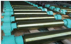
Laminar Cooling Table Rollers with Spray welding of 1580mm Rolling lines