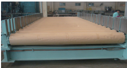
Laminar Cooling Table Rollers with Spray welding of 1780mm Rolling lines