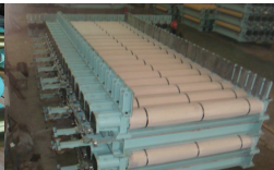
Laminar Cooling Table Rollers with Spray welding of 1750mm Rolling lines