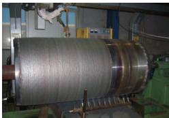
Pinch Rolls in Overlaying