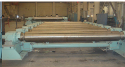
Laminar Cooling Table Rollers of 2250mm Rolling lines